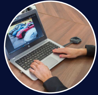
Connect to CleverCast with one tap