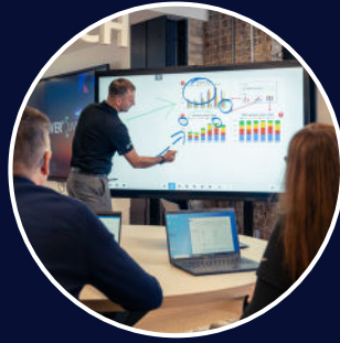
Enhanced Boardroom Collaboration