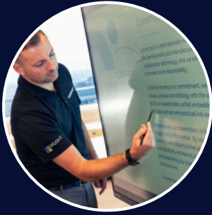
Collaboration Tools at your fingertips