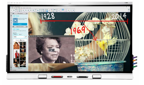
Create and deliver rich interactive lessons

Enhance lessons on the fly with ready-made iQ whiteboard templates, popular graphic organizers, interactive activities, digital manipulatives and widgets – all designed for the classroom.