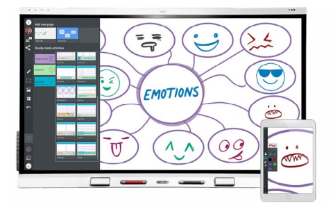
Just 3 clicks to enagement

The SMART Board 6000S series comes with an always-growing set of teaching tools and resources for student engagement, including award-winning software and the unique Tool Explorer platform. All included FREE, no subscription required.